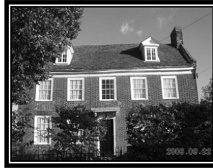
Quickrills Church Street Grade II early 18 th century