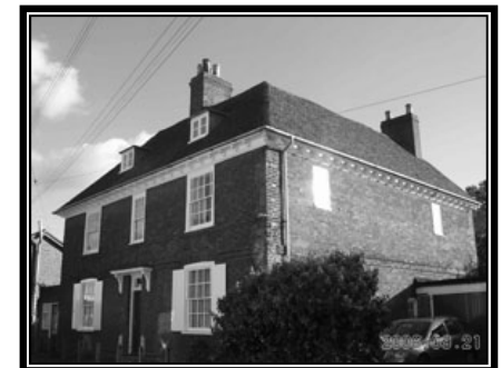
6. The Red House