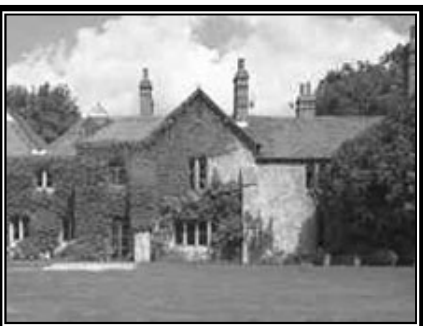
3. The Old Rectory, Grade II early 14 th century