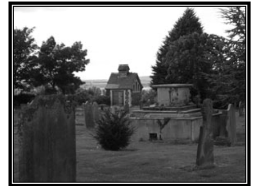
8. The Charnel House, Grade II and the Smith Monument, St Helen's Churchyard, Cliffe