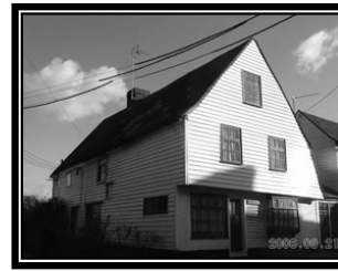
Longford House Church Street Grade II circa 1600 at one time this was a post office