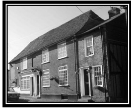
83-185 Church Street Grade II 18 th century formerly Elford's Butchers Shop