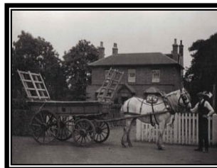
Mortimers Farm House Town Road Grade II 17 th century