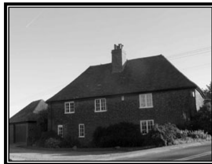
4. Newlands Farm, Station Road