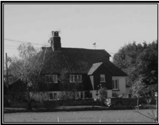
1. Allens Hill Farmhouse, Grade II late 15 th century