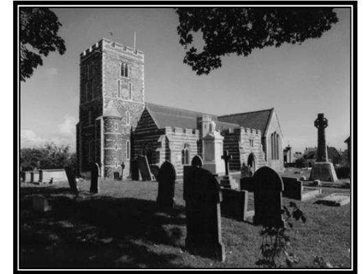
St Helens Church still has medieval wall paintings