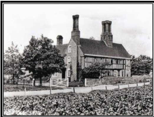
2. Manor Farm, Grade II late 16 th century