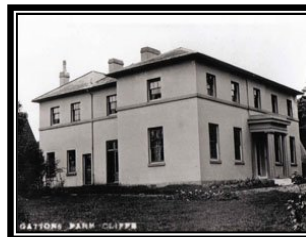
Gattons Farmhouse Grade II early 19 th century