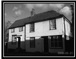
176 Church Street Grade II early 19 th century the Old Bakery

More information on some of these buildings can be found on the interpretation board located on the Buttway.