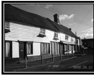
170-174 Church Street Grade II early 16 th century formerly Chestertons Grocers and Parkers store

More information on some of these buildings can be found on the interpretation board located on the Buttway.