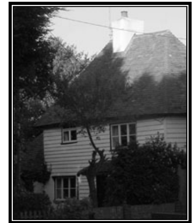
7. Walnut Tree Cottage, Wharf Lane, Grade II 16 th century